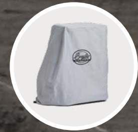
Cover For Each Size