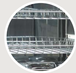
REMOVABLE RACKS Easy to clean racks, which can be configured to accommodate large pieces of protein