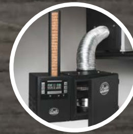
Cold Smoke Adapter