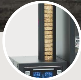
BISQUETTE CHAMBER Holds up to 9 hours of Smoking Bisquettes

cooking time, all at the push of a button. You enjoy delicious, consistent, pure smoke taste thanks again to Bradley's CleanSmoke™ Technology!