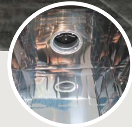
SMOKE RELEASE VENT Adjustable for added smoke control and to eliminate black rain