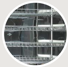
STAINLESS STEEL INTERIOR Designed to provide the best food safe environment