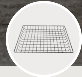
4 Pack Extra Racks